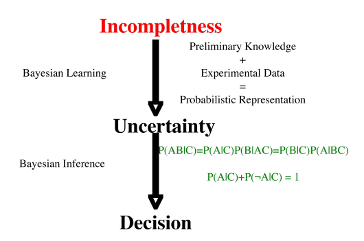
Fig. 1. The subjectivist approach to incompleteness

The subjectivist approach deals with incompleteness and uncertainty with a two steps process: learning and inference (see Figure 1).