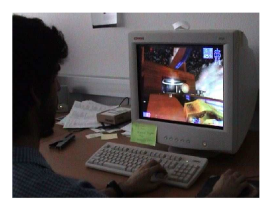
Fig. 5. Playing Unreal Tournament to train your avatar